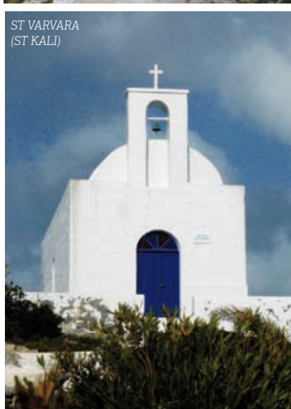
ST VARVARA (ST KALI)